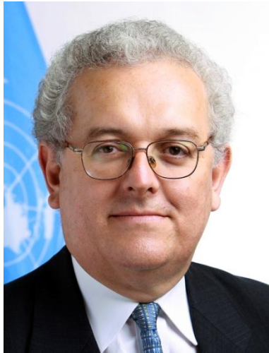
José Antonio Ocampo

Former Undersecretary for Economic and Social Affairs (2003 - 2007)